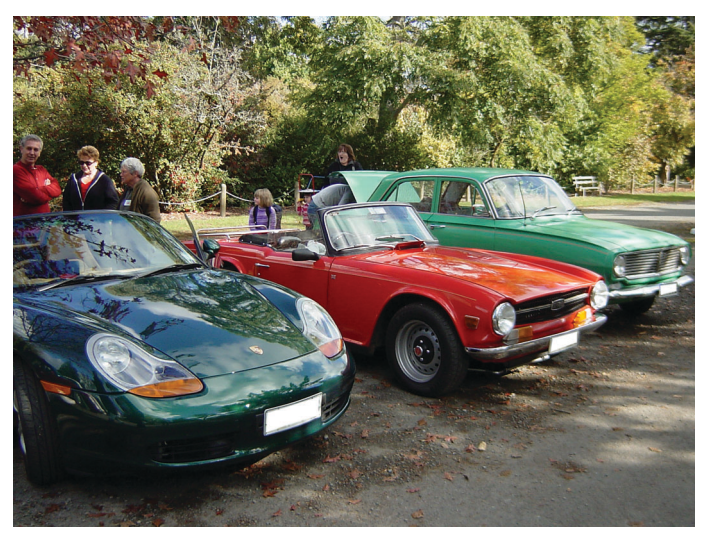
A few of the cars at the lunch stop at Ashburton Domain.

Various tourists were very interesting in the assorted collection of 14 classic cars that turned up. One Canadian couple were particularly fascinated by the Saab Sonnet of Graeme Sharp and actually took it for a short drive around the block. I apologise at this point for the lack of photos of all the cars lined up - I completely forgot to wave my camera around at the start, even though I threatened to take photos of the running repairs on the Capri.