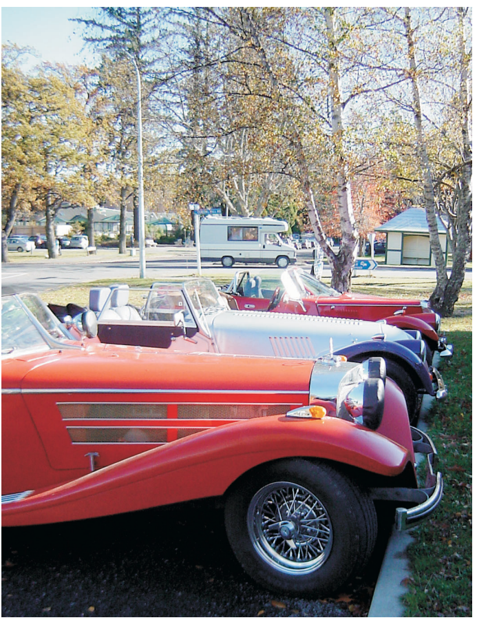
Some of the open top participants parked up in Hamner Springs, the owners presumably having gone looking for coffee.

Even though we were in our non-classic station wagon, we still enjoyed the drive through to Waiau. There was still a lot of autumn colouring on the trees and it was very peaceful. At Waiau we turned off onto a side road and ended up on an unsealed road, which was in fabulous condition. The road was damp enough that there was minimal dust and you could see for miles as you blasted through the countryside.