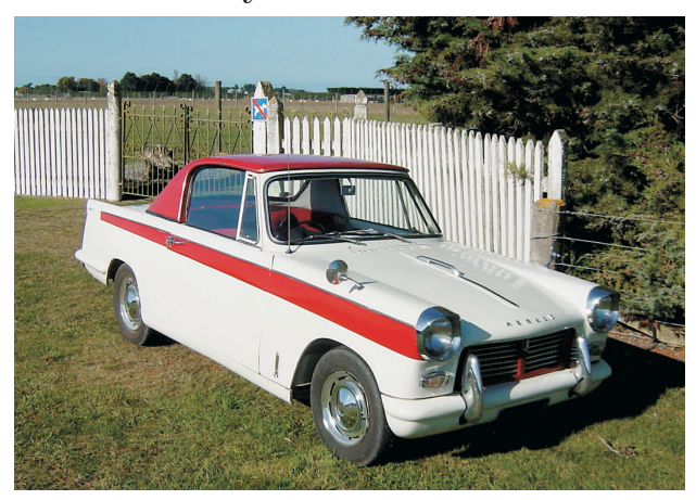
Triumph Herald parked at the Waterton Cemetery.

The day before when we'd checked the route, the weather was so unpleasant that when we called into the domain we barely stopped because it was so unpleasant. So on the Sunday it was great to be able to sit around in the sun with virtually no breeze and chat with everyone.