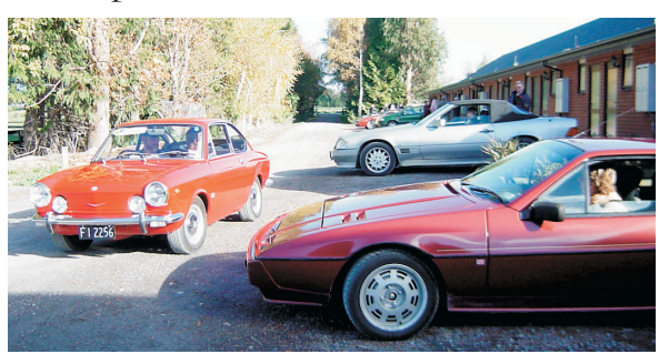
Some of the cars leaving Donegal House on Saturday morning.